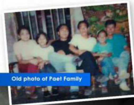
Old photo of Paet Family